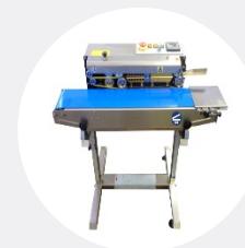
Option: Stainless Steel Stand (Horizontal Only)